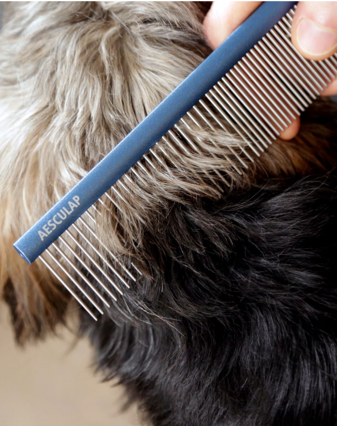
AESCULAP® FUR COMB