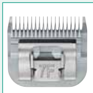
GT345 #7F 1/8" | 3.2 mm