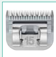
GT326 #15 3/64" | 1.2 mm