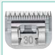
GT317 #30 1/50" | 0.5 mm