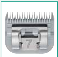
GT343 #7 1/8" | 3.2 mm