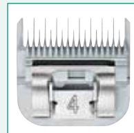
GT366 #4 3/8" | 9.5 mm