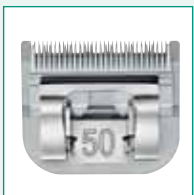
GT305 #50 1/125" | 0.2 mm