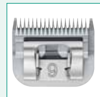
GT333 #9 5/64" | 2.0 mm