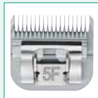
GT360 #5F 1/4" | 6.3 mm