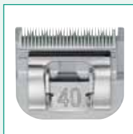
GT310 #40 1/100" | 0.25 mm