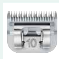
GT330 #10 1/16" | 1.5 mm