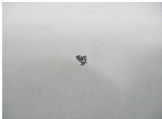
TA004627 SCREW DIN7971 M 2.2X 6.5