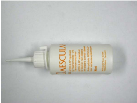
GT604 OIL CANISTER PACKED