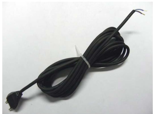
CABLE WITH PLUG **