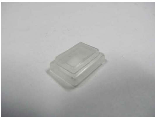
GT104249 RUBBER PROTECTION FOR SWITCH