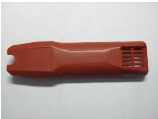
GT104802 MOTOR HOUSING- TOP