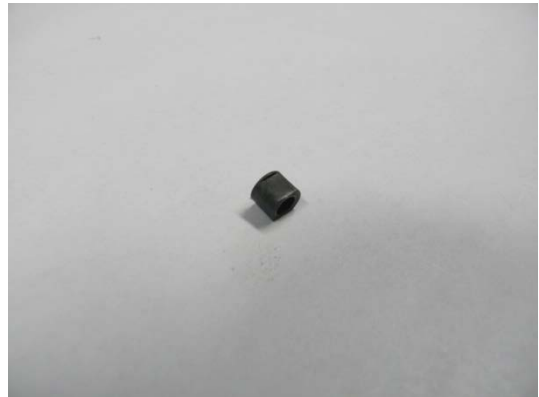
GT104244 SLIDE RING F/EXCENTER WHEEL