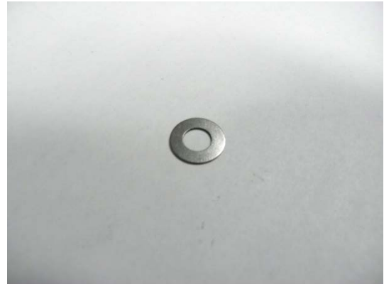
TA004637 DISKS UNDERNEATH WORM WHEEL