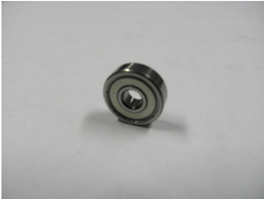
TA004631 BALL BEARING DIN 625 5X 16X 5