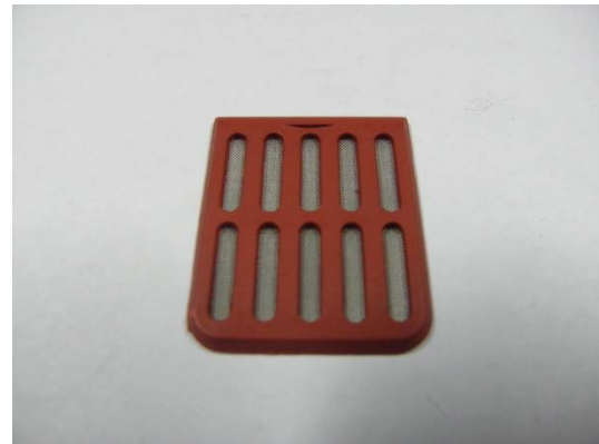
GT104803 AIR FILTER