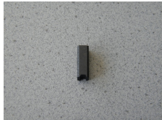
GT104614 CARBON BRUSH