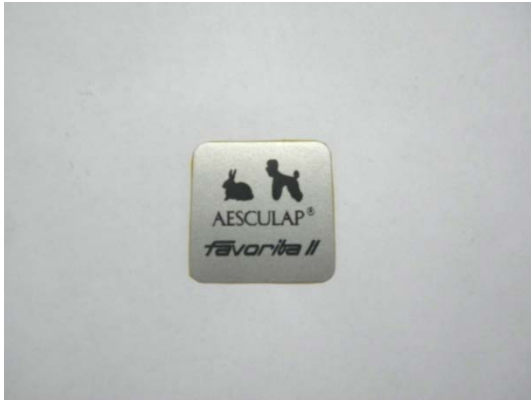
GT104337 ADHESIVE LABEL

spare part list: GT104 / GT104G Favorita II