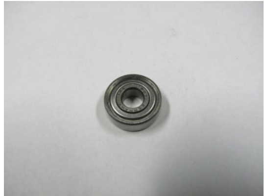
TA003544 BALL BEARING DIN 625 7X 19X 6