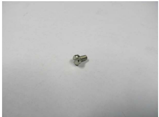
TA004663 CYLINDER SCREW F/PLATES