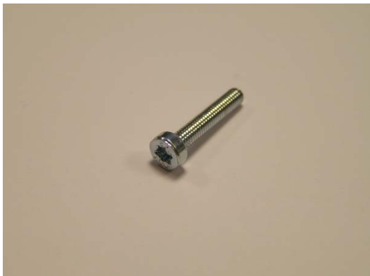
TA013499 TORX-SCREW SN4850 M3x16 TX 8.8 VZ