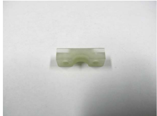
GT104213 STRAIN RELIEF DEVICE