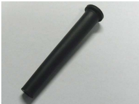
GT105326 PROTECTIVE SLEEVE