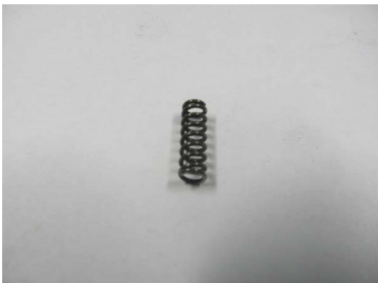
GT104217 SPRING FOR LEVER 23