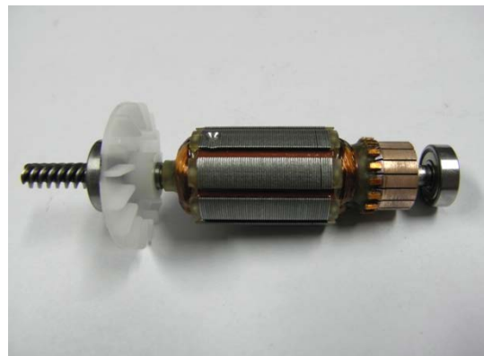
GT104865 ROTOR PACKED 230V GT104861 ROTOR PACKED 110V