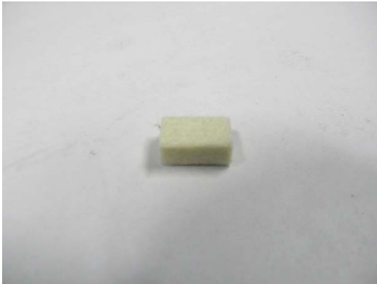
GT300224 OIL FELT 12x9