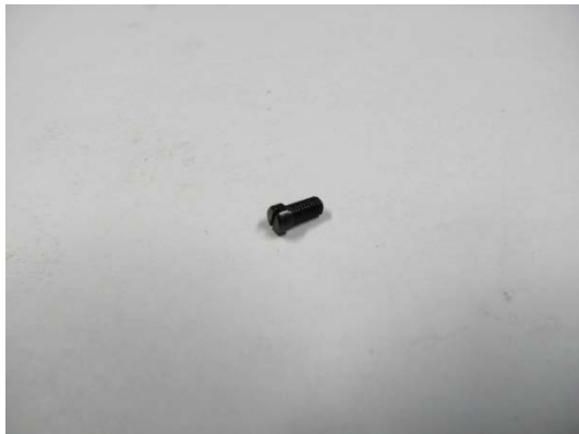
TA004639 SCREW F/SWALLOW TAIL MOUNTING