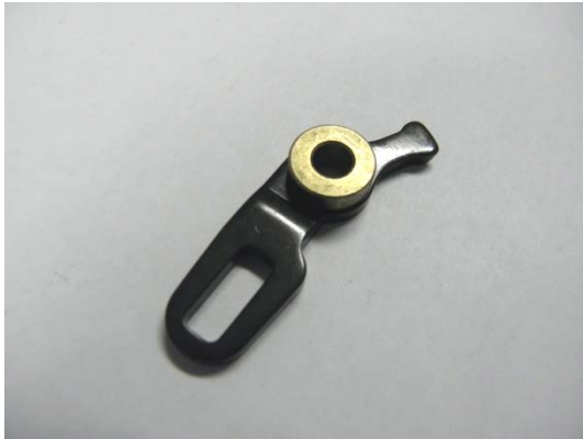
GT104808 OSCILLATING ARM OF STEEL