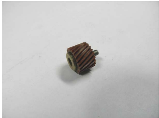
GT104840 WORM WHEEL W/EXCENTER & BEAR