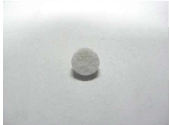
GT104225 FELT DISK F/TOP HOUSING