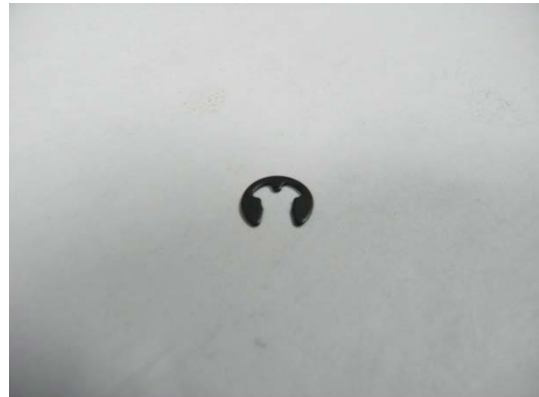
TA003820 LOCKING WASHER F/OSCILATING ARM