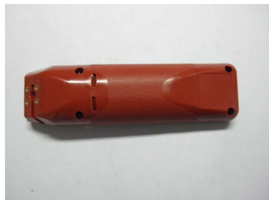
GT104801 MOTOR HOUSING- BOTTOM