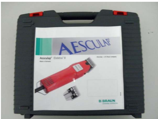
GT105819 SUITECASE and TA013315 STICKER CASE